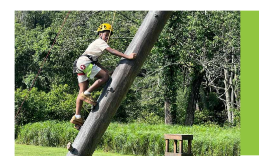
180+ hours of immersive outdoor experiences offered to middle and high school participants

Leadership & Development), in Torrey, Utah, to deliver safe, challenging, and memorable opportunities for our young men. A group of young alumni ventured to New England where they fished off the coast of Cape Cod and traveled around Nantucket as part of our Annual Summer Leadership Retreat.